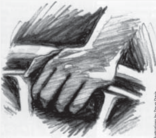
Illustrations by Doug Davis

Pentland and colleagues reported on pain complaints, strength and range of motion in 11 women with paraplegia and 11 healthy controls. They found 73 percent of women with paraplegia less than 15 years out from their spinal cord injury experienced shoulder pain during activities. Shoulder pain may be linked to impingement, tendinitis or rotator cuff tears. Studies have shown that people with pain were found to have rotator cuff tears or tendinitis in about 65 percent of the cases and aseptic necrosis of the